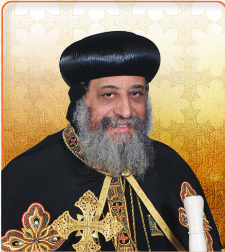
H.H. Pope Tawadros II

Pope of Alexandria & Patriarch of the See of St. Mark