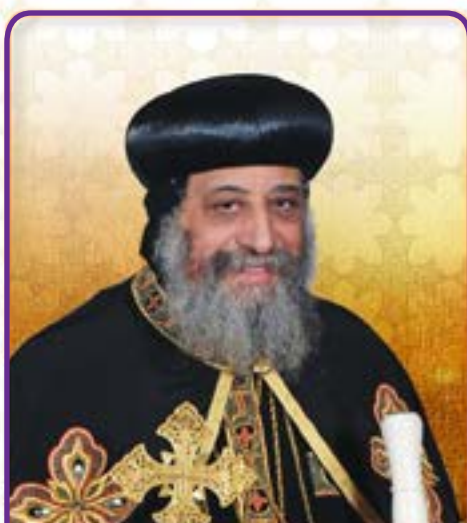
H.H. Pope Tawadros II

Pope of Alexandria & Patriarch of the See of St. Mark