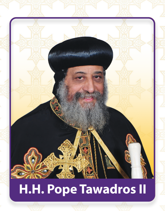
Pope of Alexandria & Patriarch of the See of Saint Mark