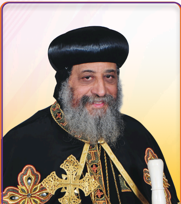
H.H. Pope Tawadros II

Pope of Alexandria & Patriarch of the See of Saint Mark