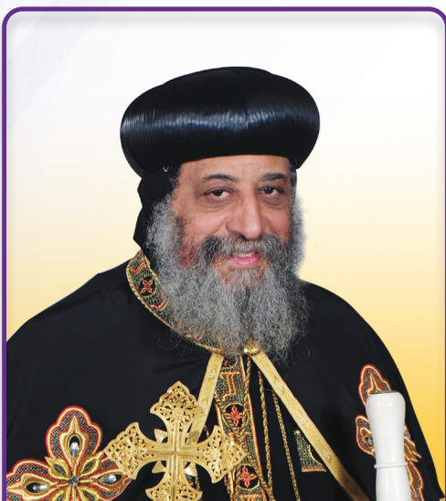
H.H. Pope Tawadros II

Pope of Alexandria & Patriarch of the See of Saint Mark