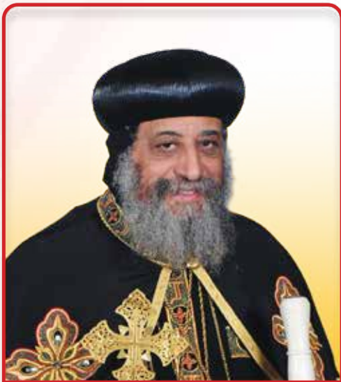
H.H. Pope Tawadros II

Pope of Alexandria & Patriarch of the See of Saint Mark