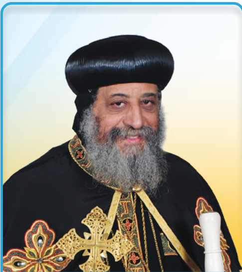
H.H. Pope Tawadros II

Pope of Alexandria & Patriarch of the See of Saint Mark