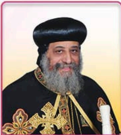
H.H. Pope Tawadros II

Pope of Alexandria & Patriarch of the See of Saint Mark