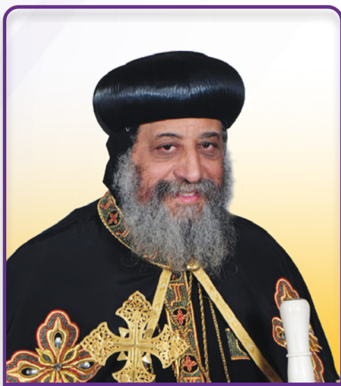
H.H. Pope Tawadros II

Pope of Alexandria & Patriarch of the See of Saint Mark