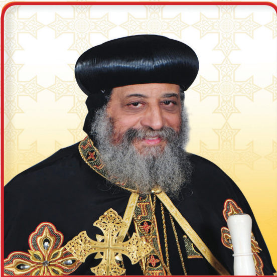
H.H. Pope Tawadros II

Pope of Alexandria & Patriarch of the See of St. Mark